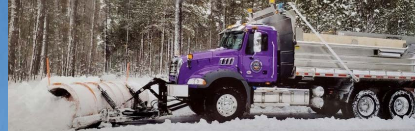
White Mountain Apache Tribe - Granite Dump