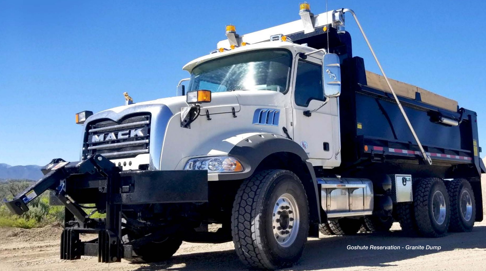
Goshute Reservation - Granite Dump