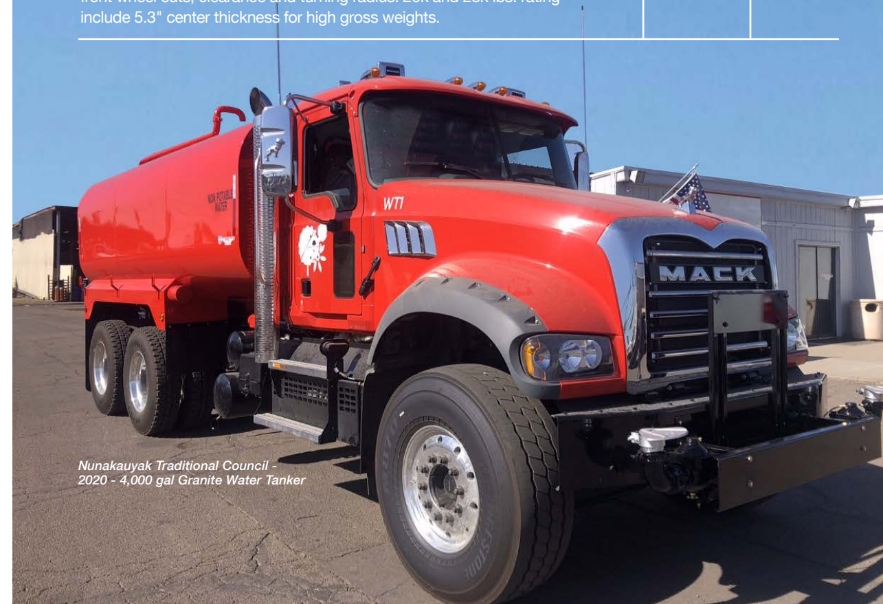
Nunakauyak Traditional Council - 2020 - 4,000 gal Granite Water Tanker