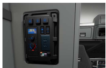
FLAT ROOF DESIGN